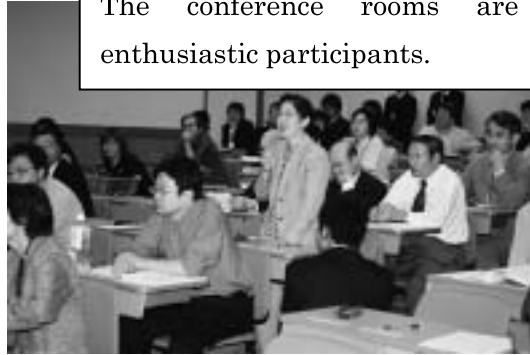
The conference rooms are full of enthusiastic participants.